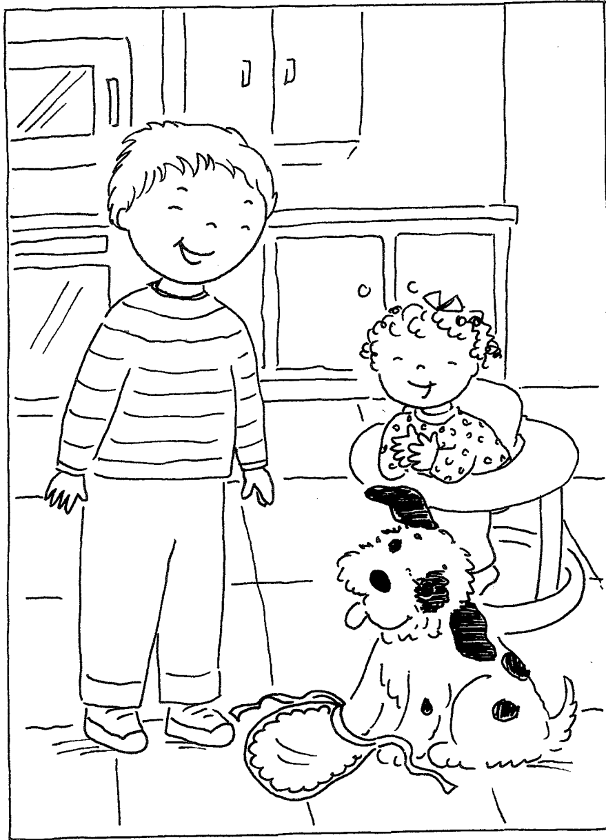
Bam Bam sat.

Copyright © Houghton Mifflin Company. All rights reserved.