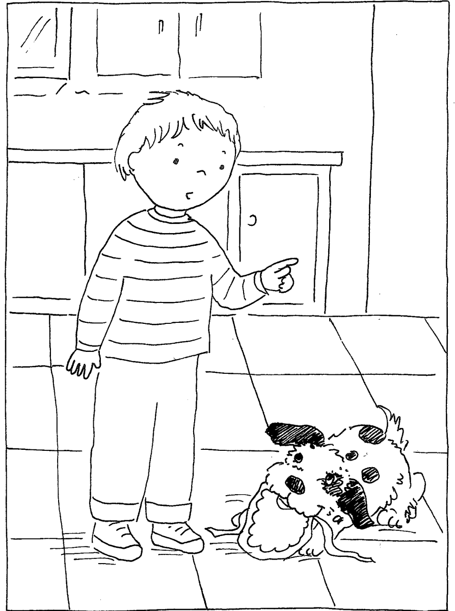
Sit, Bam Bam!