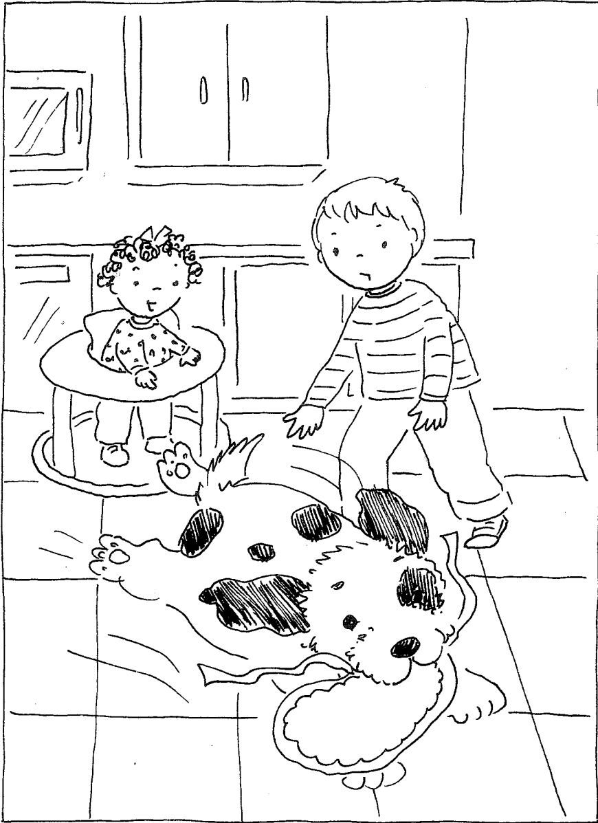
Bam Bam bit the bib.