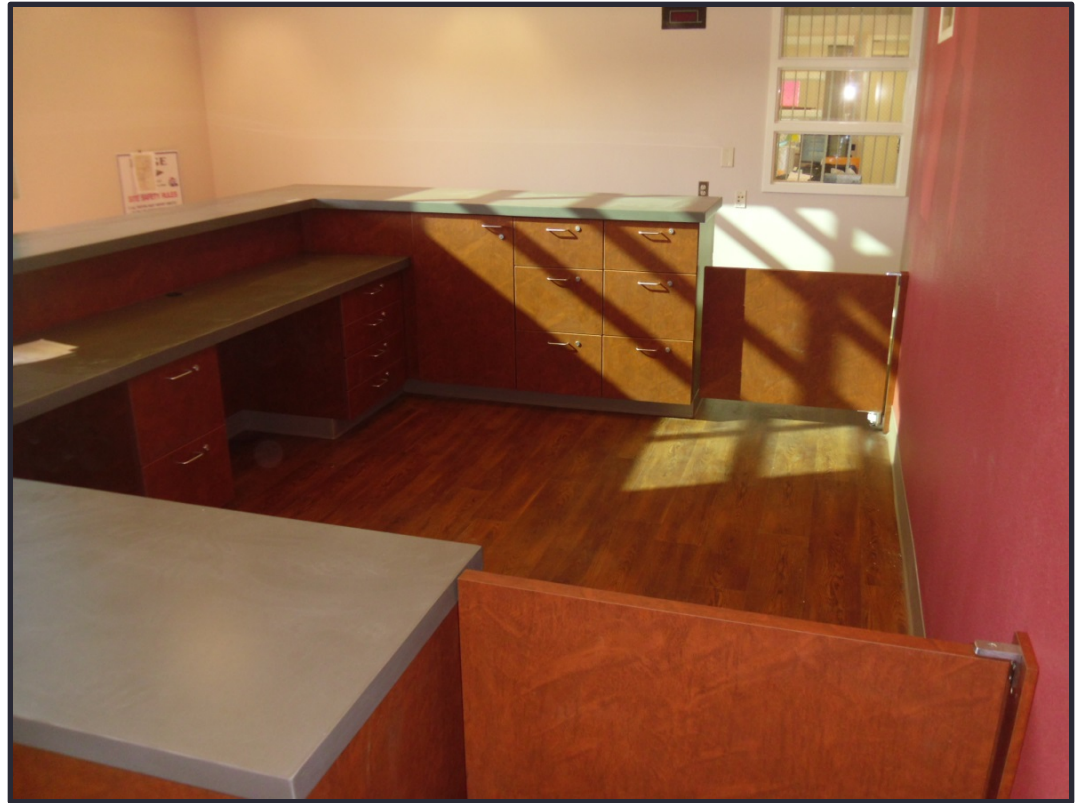
Administrative Services Modernization