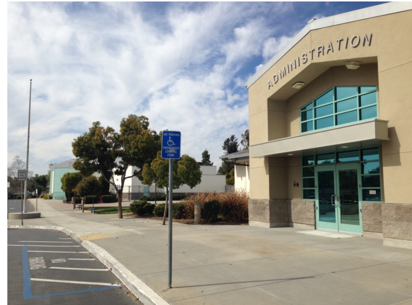
New Front Entry