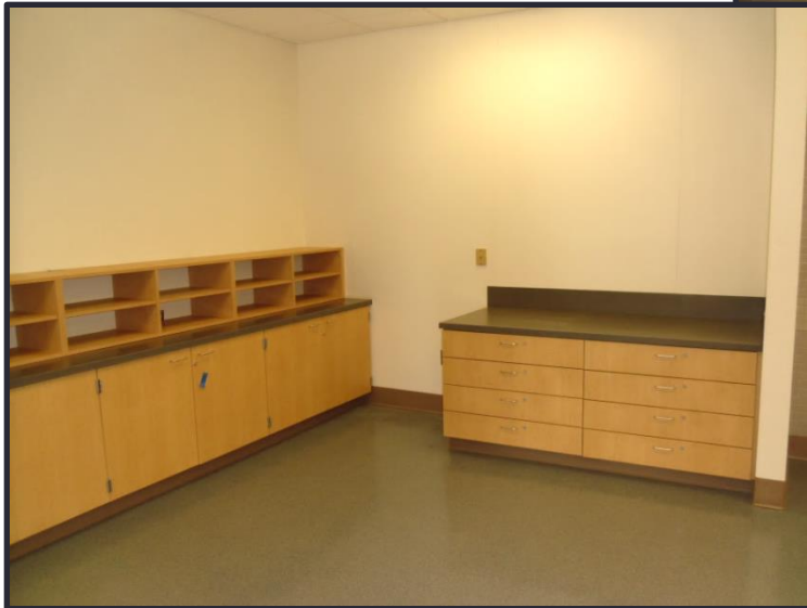
Visual Arts Classroom Modernization