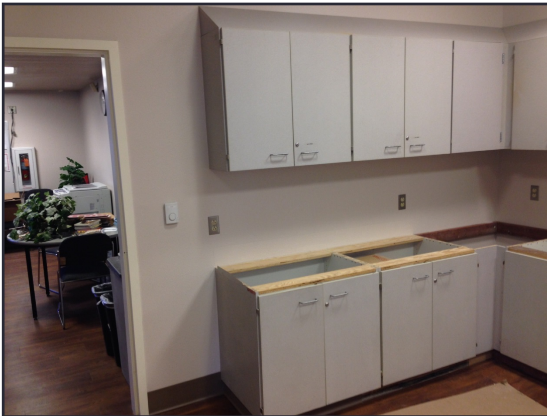
Existing Workroom Modernization