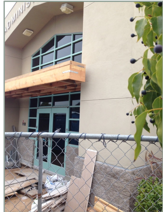
New Front Entry Canopy