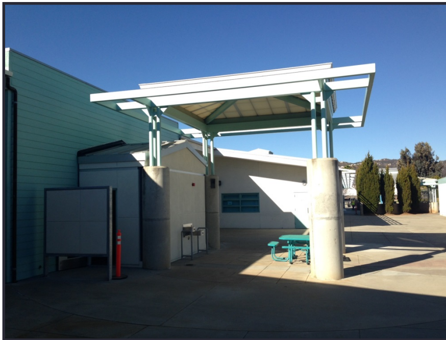
New Restroom Addition