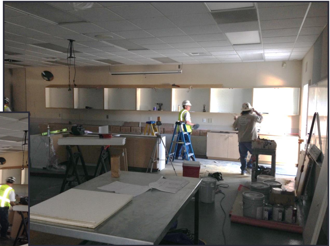
Visual Arts Classroom Modernization